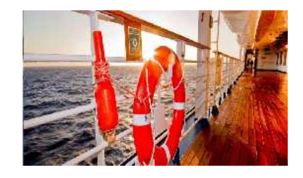
Lido: A term meaning resort often used to describe a particular deck, usually where pools are located