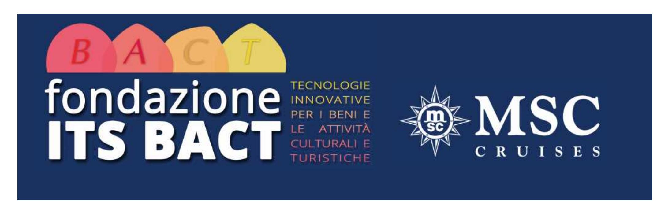
Figura nazionale 5.1.2 Tecnico Superiore per la Gestione di Strutture Turistico-Ricettive (VI livello EQF)