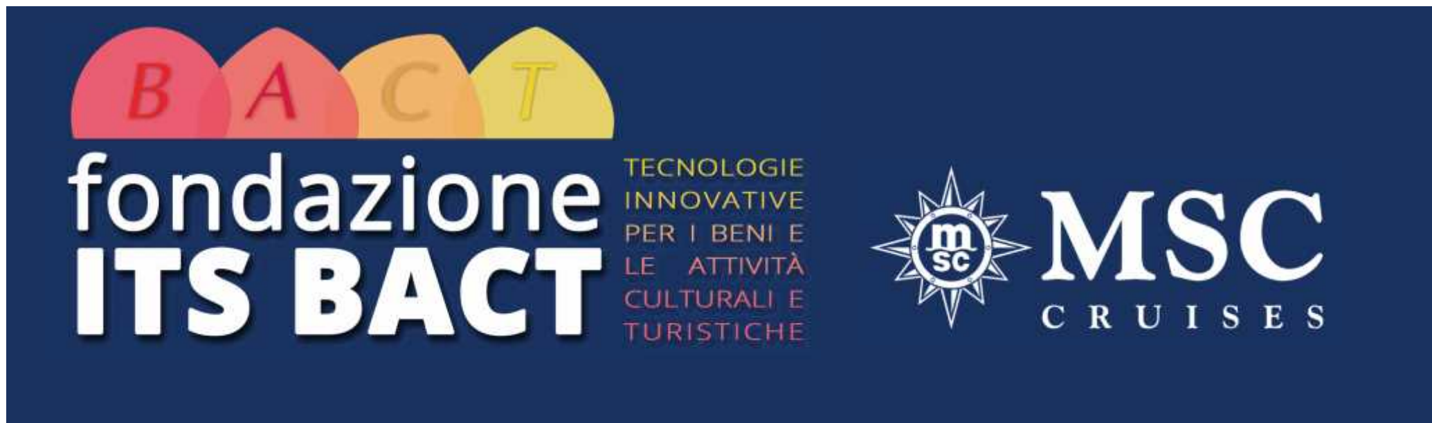
Figura nazionale 5.1.2 Tecnico Superiore per la Gestione di Strutture Turistico-Ricettive (VI livello EQF)